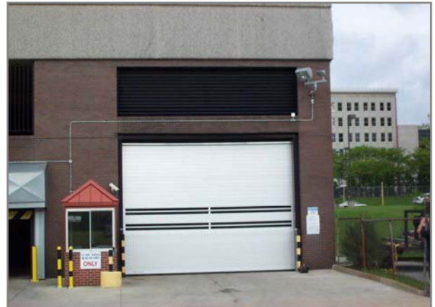
Albany's Rapid Roll 3000 Akron Federal Building