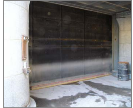
Metzenbaum Federal Courthouse