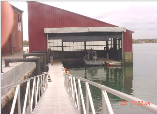
Albany's M&I Door System Naval Boat Yard Parking

Albany Door Systems has processes and procedures that augment the GSA procurement system. Albany door products are purchased directly through the GSA advantage, schedule or contract and also through approved General Contractors. Project flow is controlled by our Contract Administrator and Regional Managers and installation is performed by our certified Dealer Partners. This project management process enables us to streamline procurement, ensure consistency and develop custom high performance door solutions with quicker response times to ensure customer satisfaction.