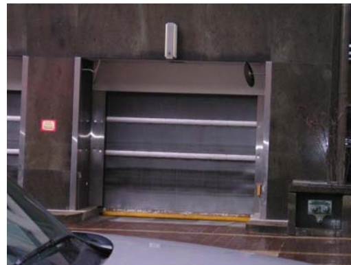
J.W. Peck Building Federal Building