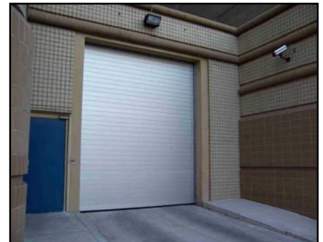
Clark County Detention Center