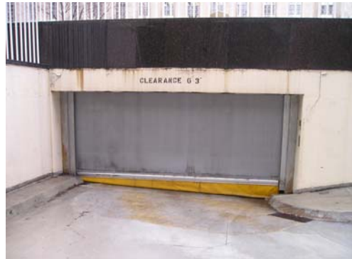
Federal Reserve Bank, Cincinnati, OH